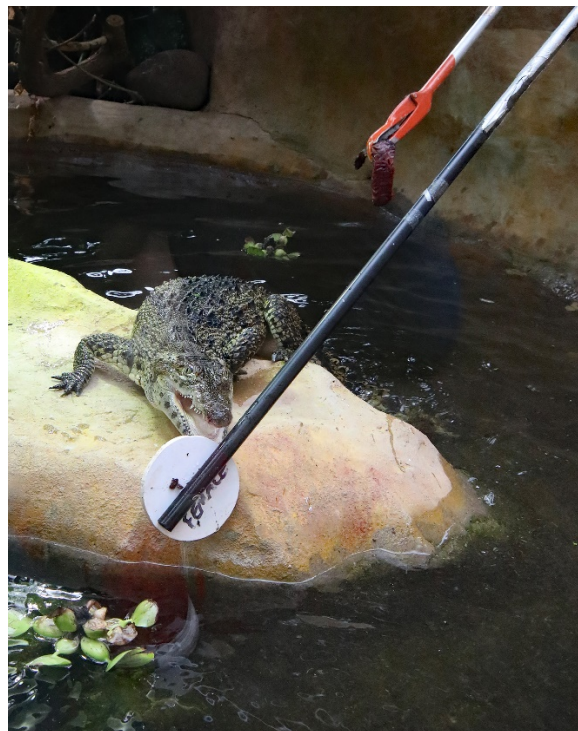
(Crocodile training under protected contact at Paignton Zoo)

170. With all animals, the decision to allow 'hands on' contact must not be left to individuals' own personal preferences but should be part of a very clear organisational policy, with absolute limitations and controls. This is particularly important for animals in Category 1 as: