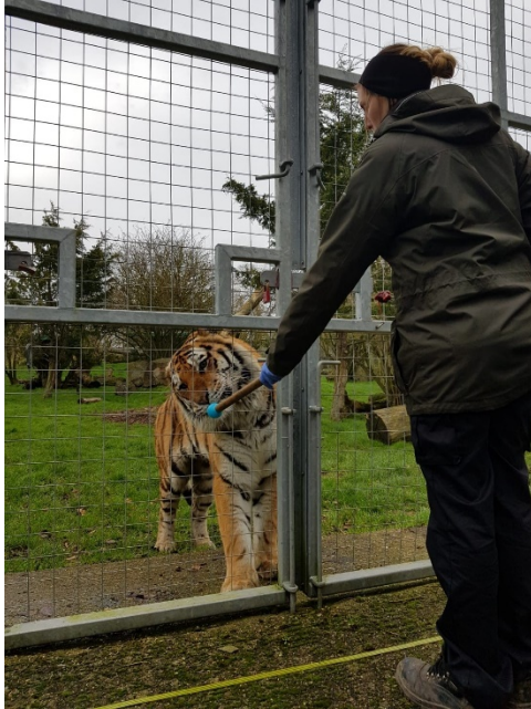
(Tiger training: Marwell Zoo)

Training large carnivores can present a risk of serious injury or fatal injury. A zoo restricted training to specific safe working areas with smaller gauge mesh to prevent training tools (for example, feeding tongs) to enter or be pulled through into the enclosure. Safe distance zones are marked on the floor as a visual reminder and all training equipment (such as target sticks) are long enough to prevent animal contact. Safe training areas are included in the design of all new enclosures.