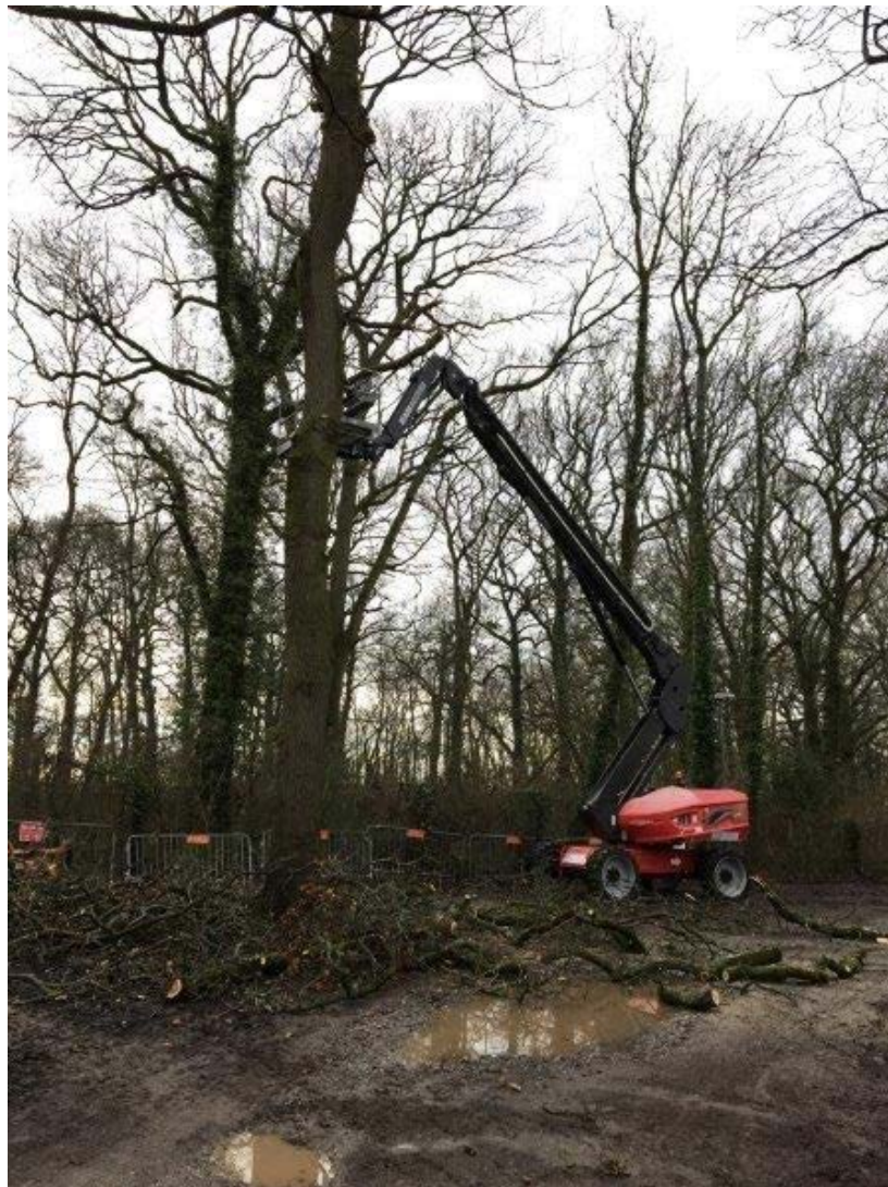
(Tree Management: Marwell Zoo)