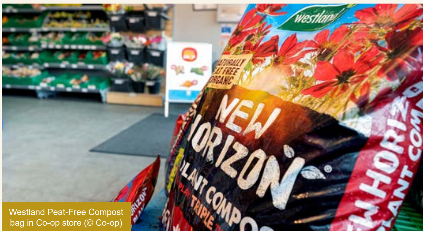
Westland Peat-Free Compost bag in Co-op store

Westland's New Horizon product is based on wood-fibre which is a renewable resource made from wood-chips at their production site in Northern Ireland. Westland are signed up to the UK's Responsible Sourcing Scheme for their growing media production.