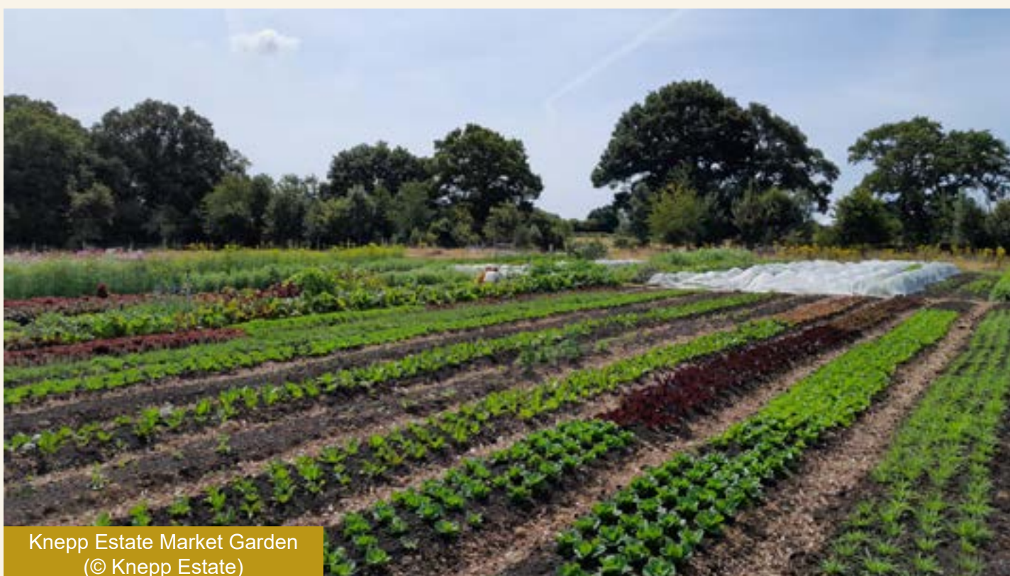
Knepp Estate Market Garden

A similar practice is used in all of Knepp’s other garden areas too, although currently the Market Garden is the only site in conversion to Soil Association status.