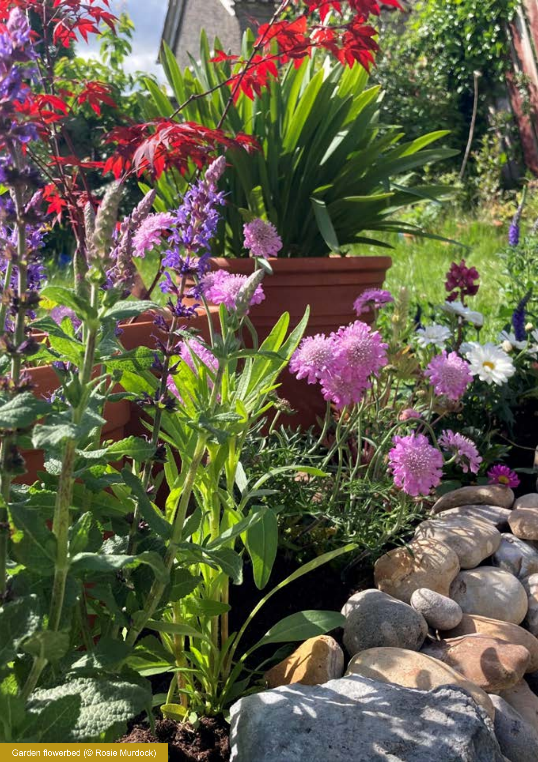
Garden flowerbed