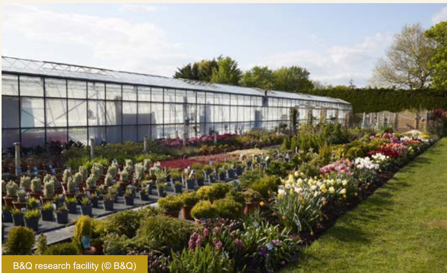
B&Q research facility

B&Q now sell a large range of peat-free products under the GoodHome brand, as well as branded peat-free products. They undertake trial work at their research nursery in Hampshire to help drive continuous improvement in their products.