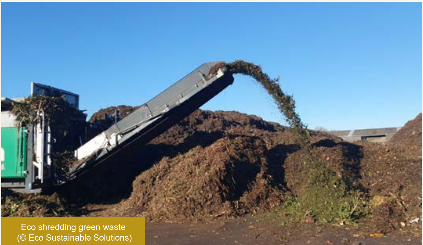
Eco shredding green waste