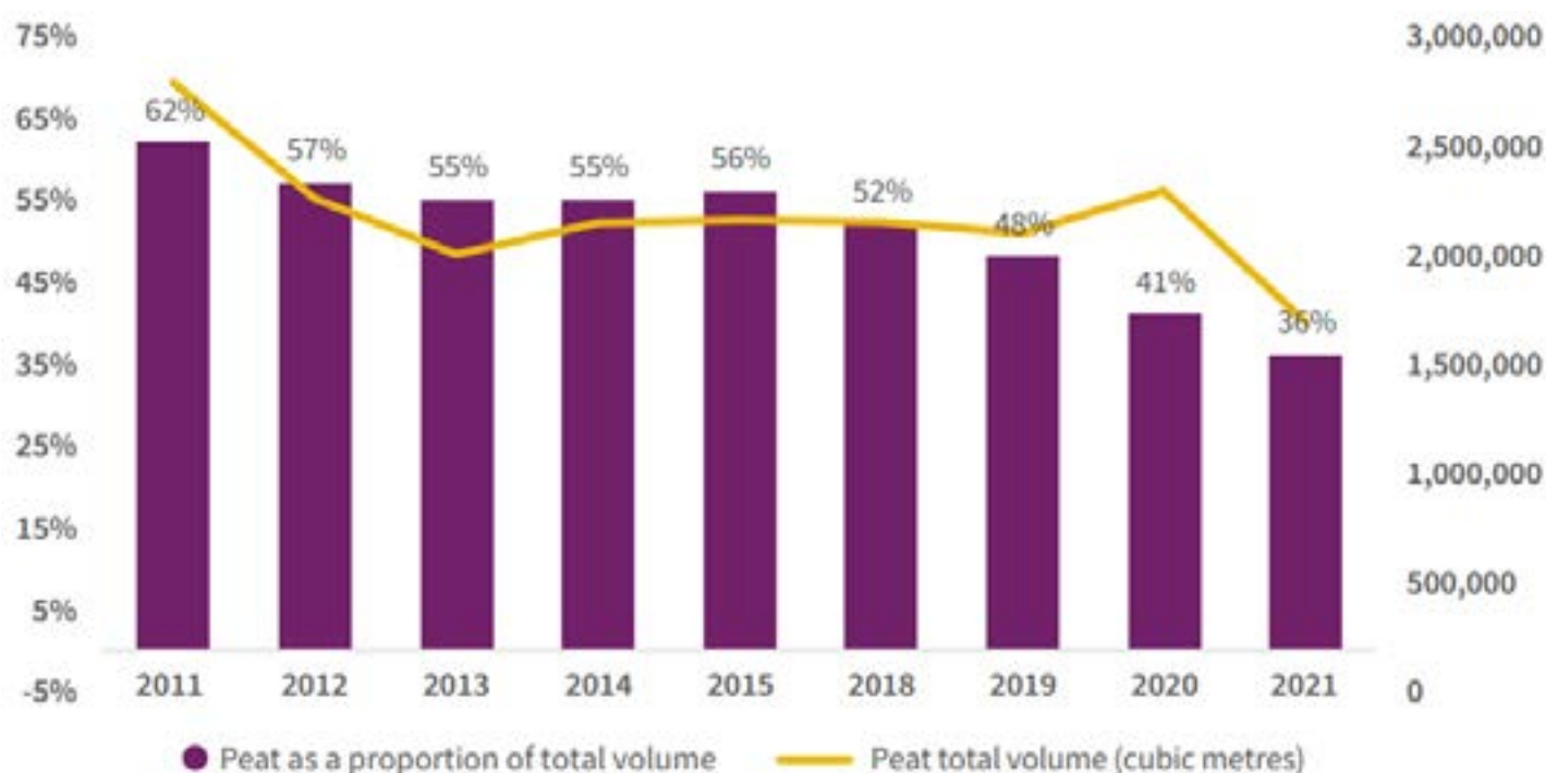
Volumes of peat sold in the retail and professional markets 2011-2021 and peat as a proportion of total growing media volume sold (HTA, 2022)

The HTA Growing Media Monitor Report gives data for the use of peat and alternative materials in both the retail (amateur gardening) and professional horticultural sectors.