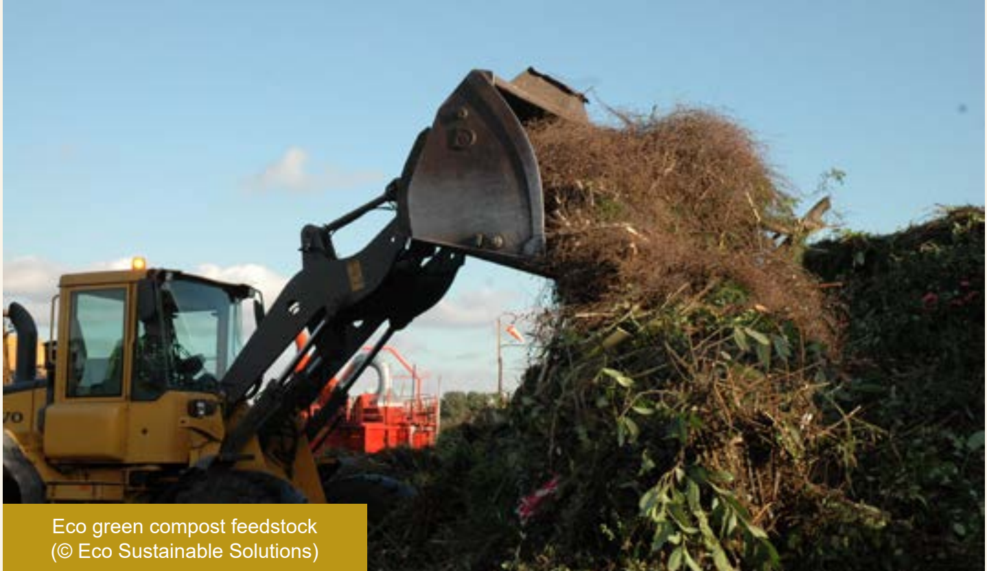
Eco green compost feedstock