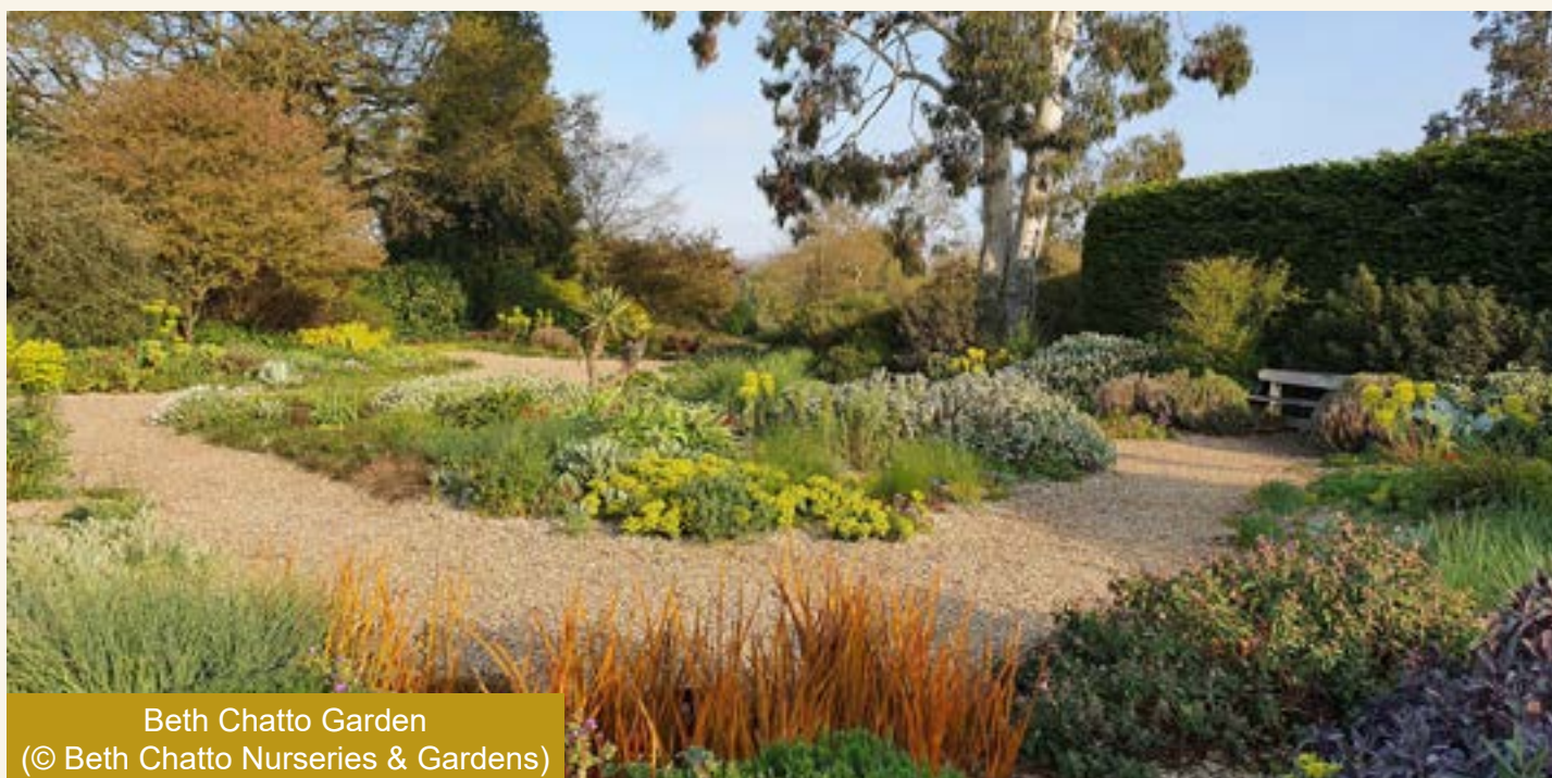
Beth Chatto Garden