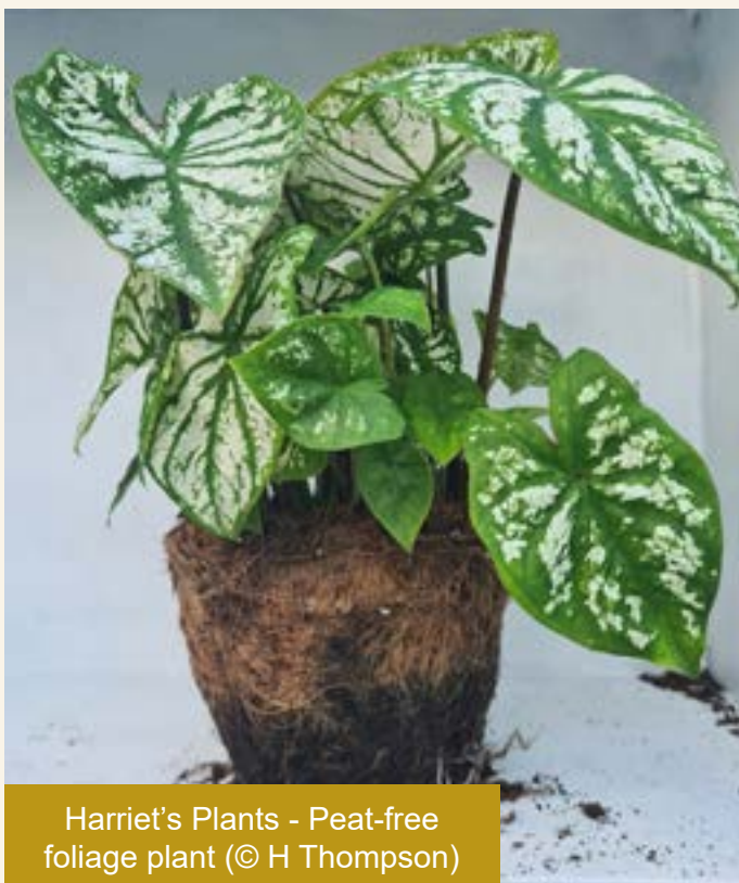
Harriet's Plants - Peat-free foliage plant

The houseplant growing industry in the UK has declined with only a few producers left and the majority of plants are imported from the Netherlands and further afield.