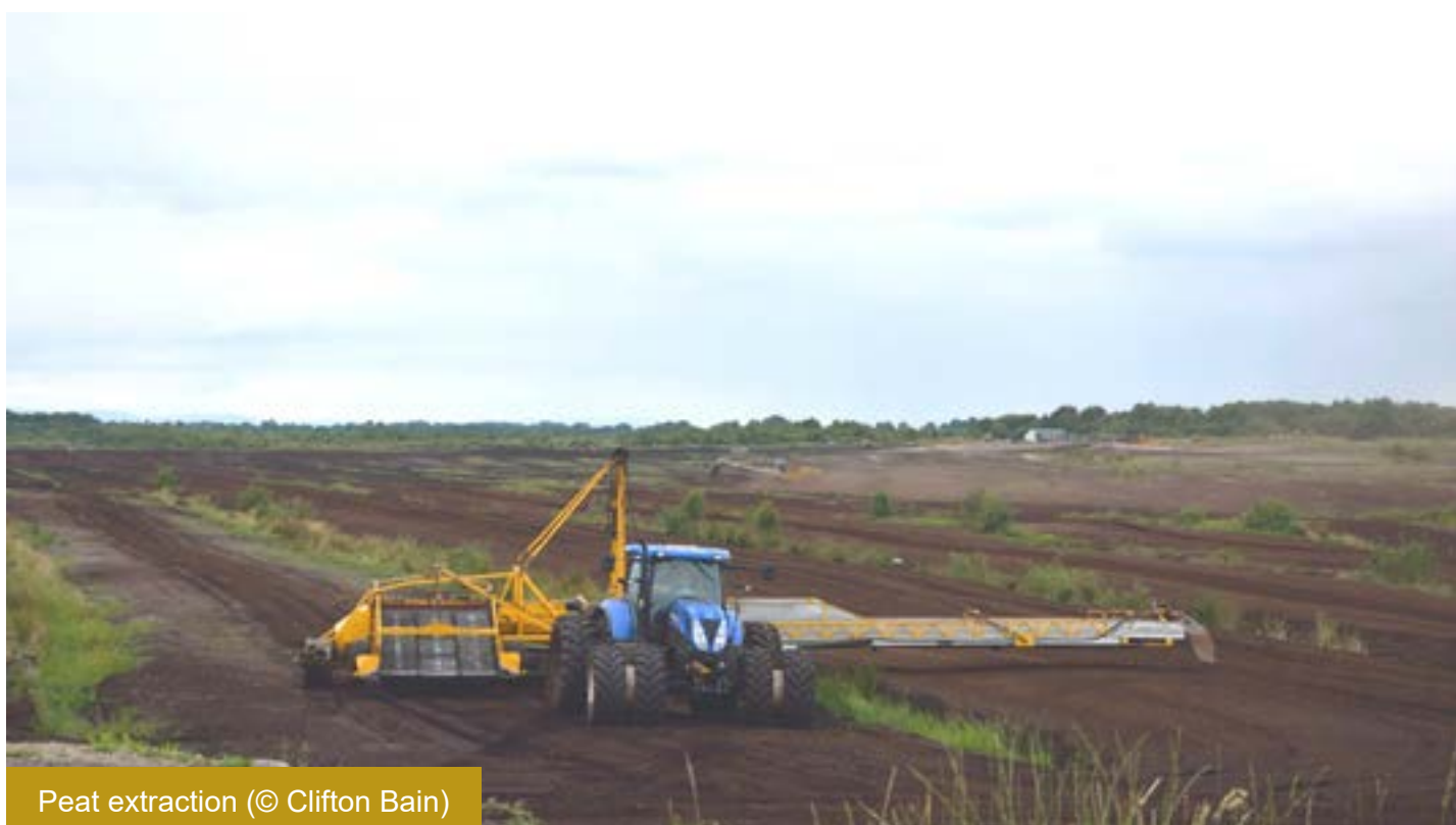
Peat extraction

The Scottish Government is consulting (February 2023) on a ban on the sale of peat related gardening products.