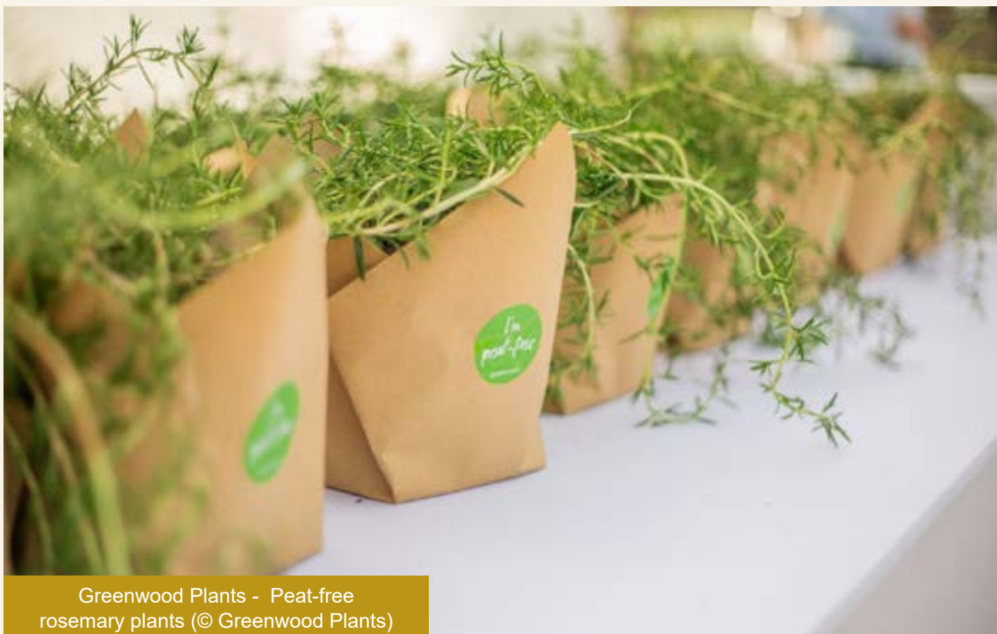
Greenwood Plants - Peat-free rosemary plants

Over the past year, Greenwood has initiated several pioneering sustainability practices to use resources efficiently, reduce waste, encourage biodiversity, and improve its carbon footprint – such as launching its G Cycle scheme, switching diesel forklifts and other vehicles to electric, reducing waste, recycling water, using biodegradable sundries, and becoming a peat-free grower.