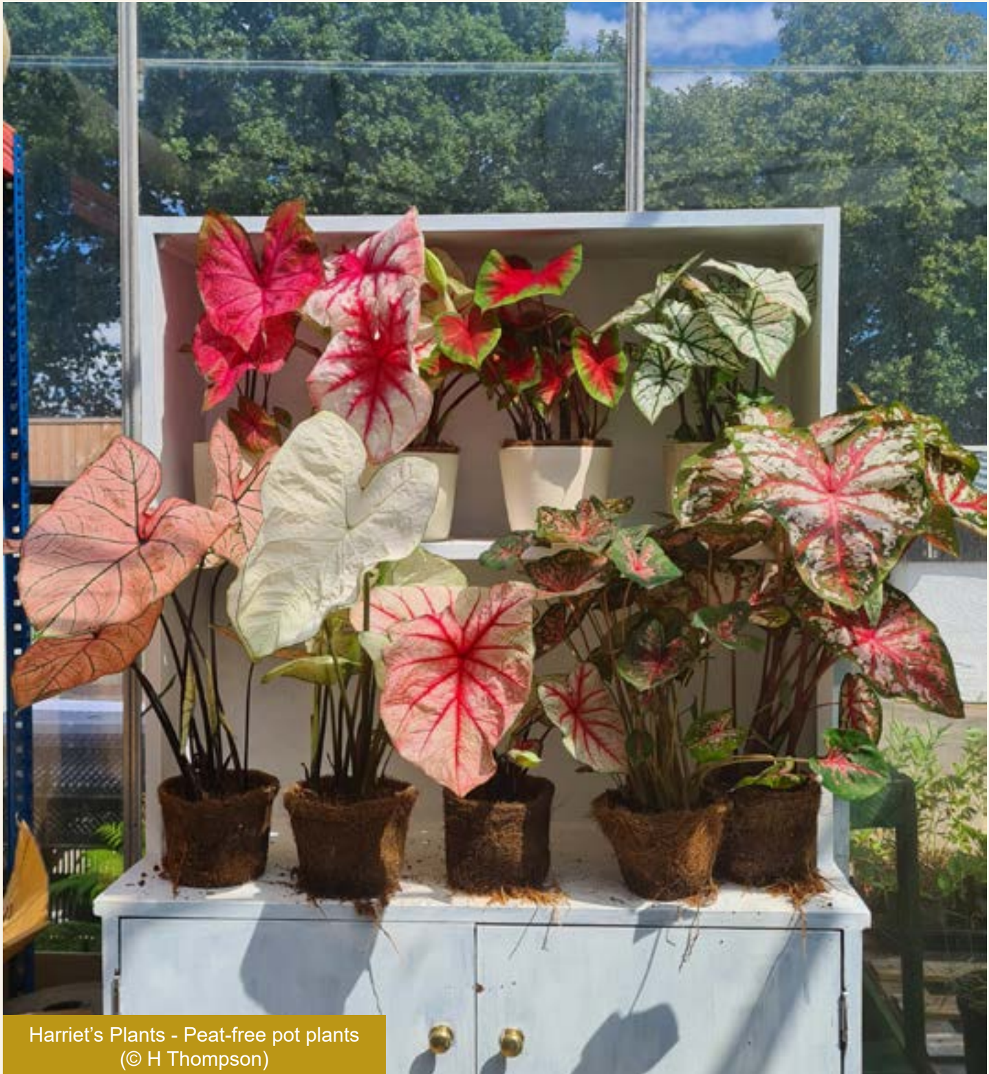
Harriet's Plants - Peat-free pot plants

"We can all do our part to reduce our impact on the planet and choosing to be peat-free is a good place to start."