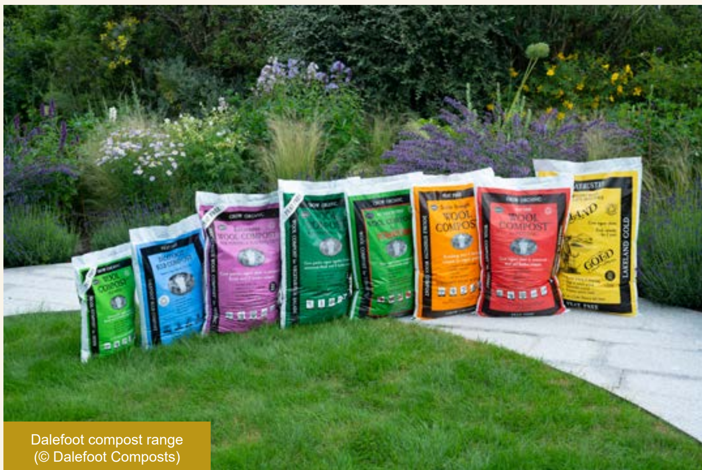
Dalefoot compost range

Actively involved in promoting peat-free, RHS Chelsea 2022 had the first ever installation of a peat bog – under licence from Natural England, where Dalefoot Composts and the Eden Project combined forces to enable gardeners to experience the wonders of a living peat bog and explain that good peat-free gardening can help gardeners reverse climate change.