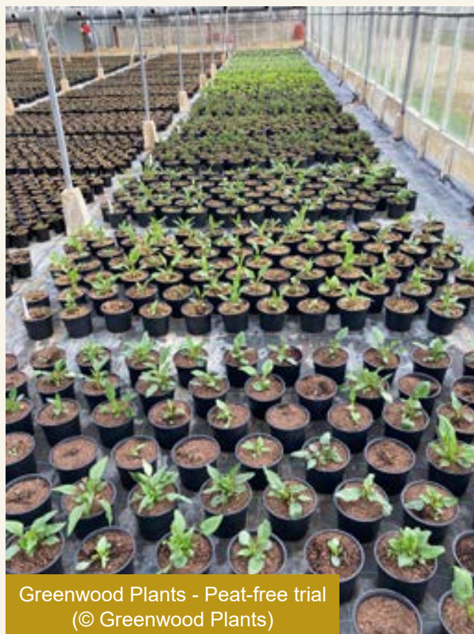
Greenwood Plants - Peat-free trial

Greenwood will continue its peat-free trials into 2023, scaling the size of the trials to increasingly significant numbers, to ensure it is fully ready to support its annual production of more than six million plants in peat-free growing media from 2023.