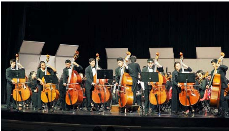
The concert concluded with the exuberant finale of Beethoven's Symphony #7.