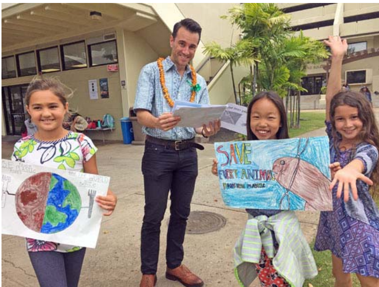
On Thursday, students screened "Chasing Coral," a film depicting the devastating effects of climate change on coral reefs, and the week concluded with