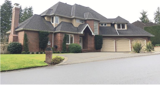
Grade 11 Year Built 1988 / Total Living Area 3440 sqft