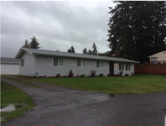
Grade 6 / Year Built 1977 / Total Living Area 1460 sqft