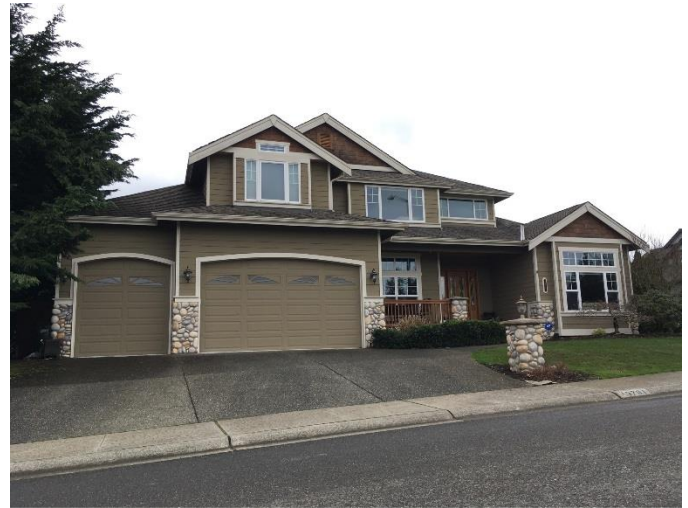
Grade 9 / Year Built 2001 / Total Living Area 3960 sqft