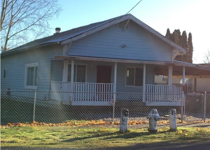
Grade 5 / Year Built 1900 / Total Living Area 1100 sqft