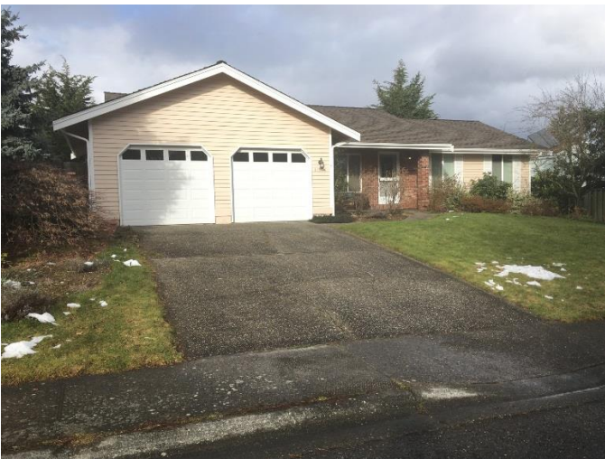
Grade 7 / Year Built 1968 / Total Living Area 1240 sqft