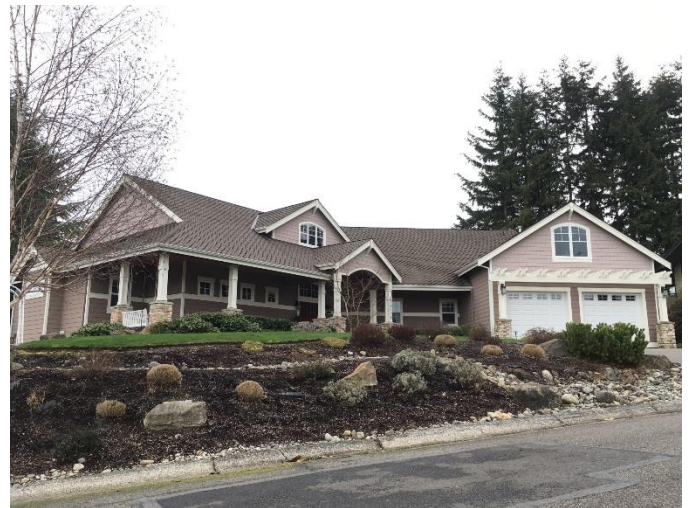
Grade 10 / Year Built 2010 / Total Living Area 3270 sqft