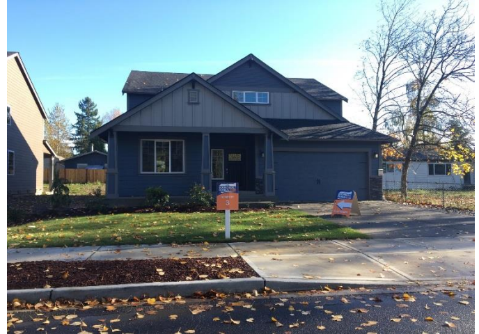
Grade 8 / Year Built 2016 / Total Living Area 3027 sqft