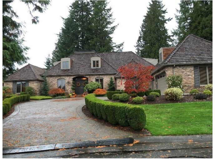
Grade 12 / Year Built 1981 / Total Living Area 4660 sqft